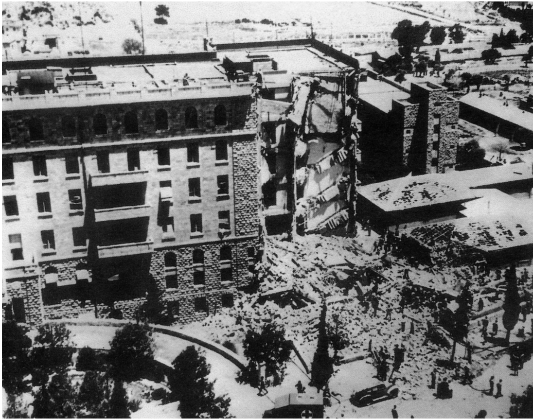
The King David Hotel, Jerusalem, July 1946.

20 Study the photograph, and then answer the questions which follow.